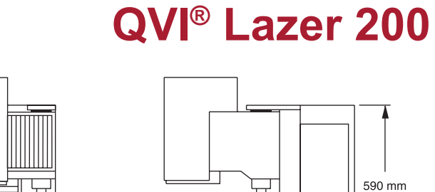
System weight: 100 kg (uncrated), 150 kg (crated)